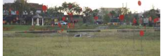
“Poppy Field” on Fountain Green